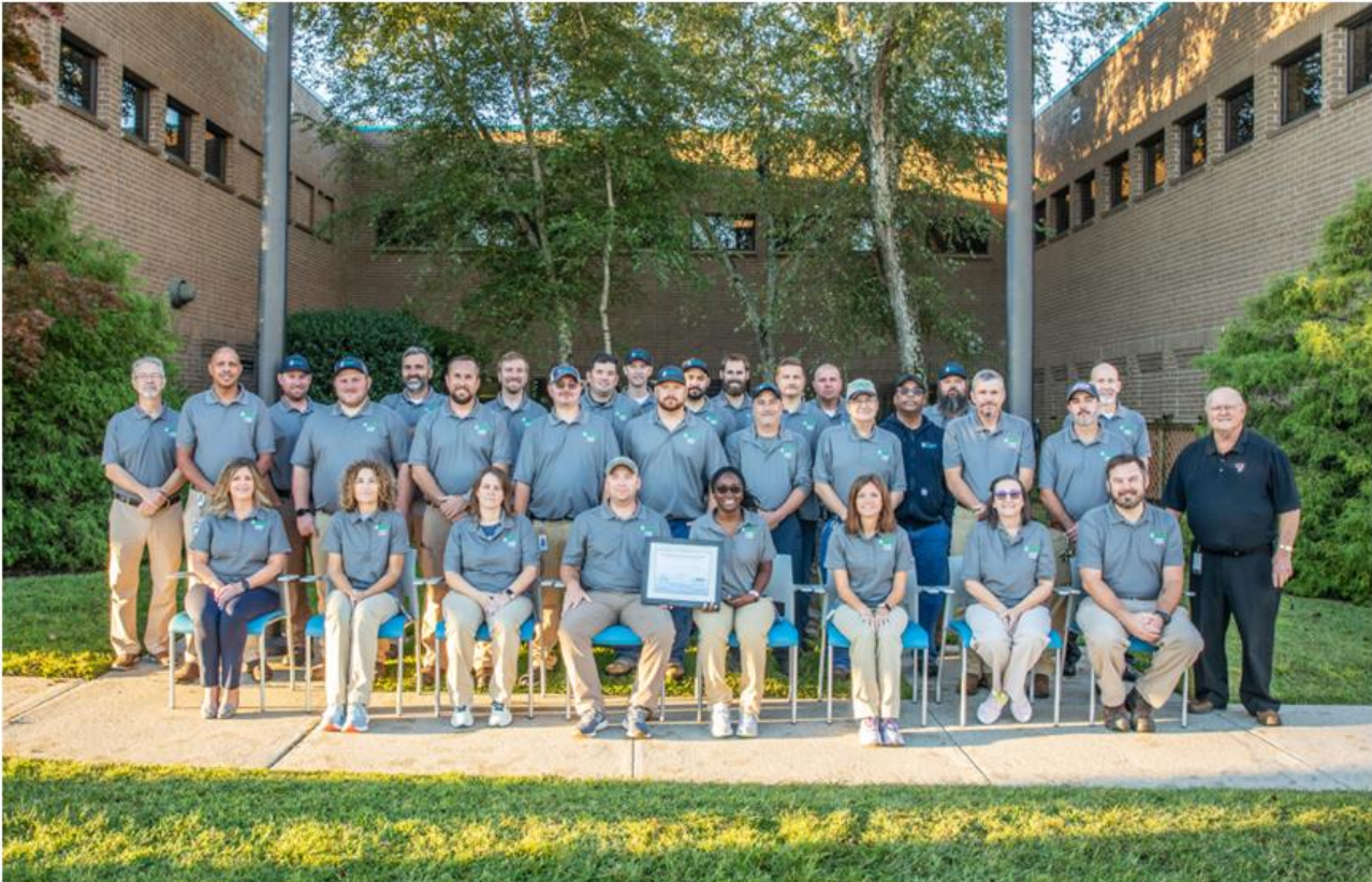
GUC was awarded its 7th consecutive Area Wide Optimization Award and the Partnership for Safe Water Directors Award in 2022.